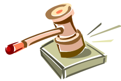
Governing Board Policy 5132(a)

The Governing Board believes that appropriate dress and grooming contribute to a productive learning environment. The Board expects students to